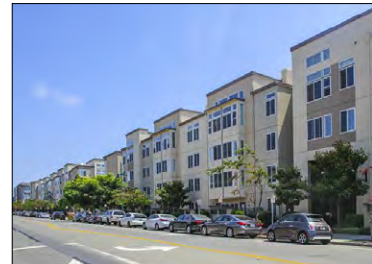
The Courtyards at 65th Street

City: Emeryville, Calif. Buyer: Essex Property Trust Purchase Price: $178 MM Price per Unit: $537,764