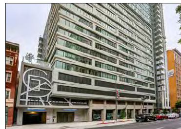
The Grace on Spring

City: Los Angeles Buyer: daydream apartments Purchase Price: $204 MM Price per Unit: $678,333