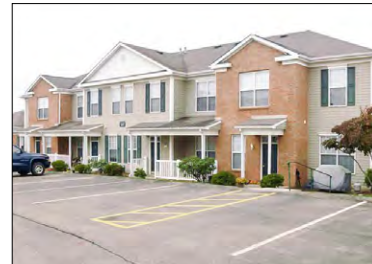
Bear Run Village

City: Pittsburgh, Pa. Buyer: Nexus Real Estate Purchase Price: $46 MM Price per Unit: $104,452