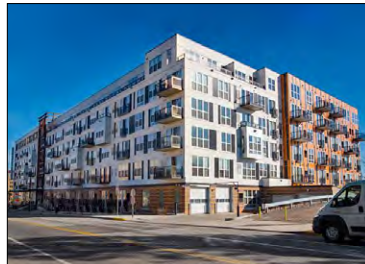
Morrow Park City

City: Pittsburgh, Pa. Buyer: Albion Residential Purchase Price: $51 MM Price per Unit: $237,127