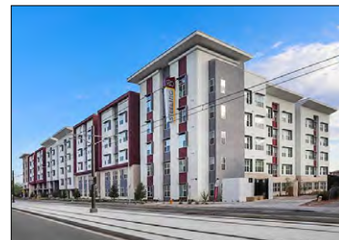
Sterling 920 Terrace

City: Tempe, Ariz. Buyer: Coastal Ridge Real Estate Purchase Price: $115 MM Price per Unit: $442,308