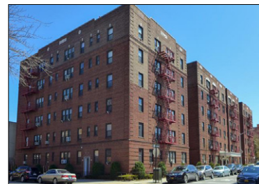
1701 W. Third St.

City: New York City Buyer: Parkoff Org. Purchase Price: $28 MM Price per Unit: $261,945