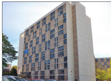
Shore Hill Housing

City: New York City Buyer: Jonathan Rose Cos. Purchase Price: $149 MM Price per Unit: $267,281