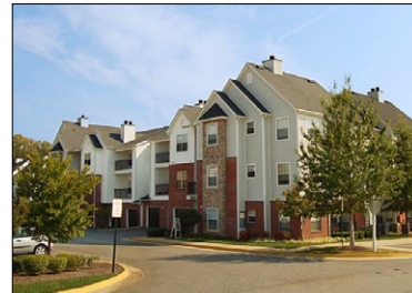
Crowne at Swift Creek

City: Midlothian, Va. Buyer: Sentinel Real Estate Purchase Price: $60 MM Price per Unit: $190,705