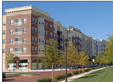
The Flats at West Broad Village

City: Glen Allen, Va. Buyer: Pollack Shores Purchase Price: $76 MM Price per Unit: $222,714