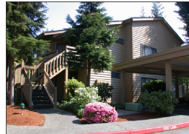
The Park in Bellevue

City: Bellevue, Wash. Buyer: Continental Properties Purchase Price: $91 MM Price per Unit: $493,207