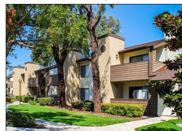
The Landing at Long Beach

City: Long Beach, Calif. Buyer: Silver Star Real Estate Purchase Price: $72 MM Price per Unit: $349,515