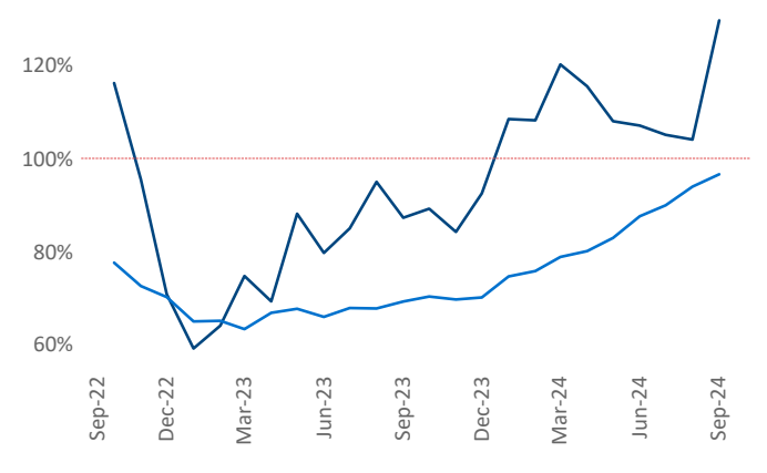
Absorbed Completions T12