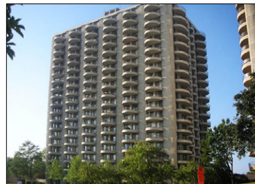
ReNew Wheaton Center

City: Wheaton, Ill. Buyer: FPA Multifamily Purchase Price: $131 MM Price per Unit: $172,823