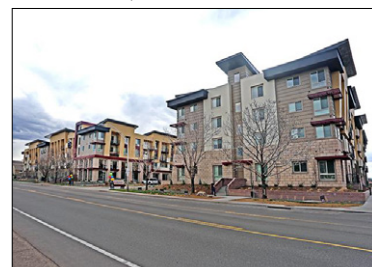
AML Cherry Creek

City: Glendale, Colo. Buyer: AMLI Residential Purchase Price: $108 MM Price per Unit: $316,191