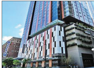
Premiere on Pine

City: Seattle Buyer: Heitman Purchase Price: $243 MM Price per Unit: $630,440