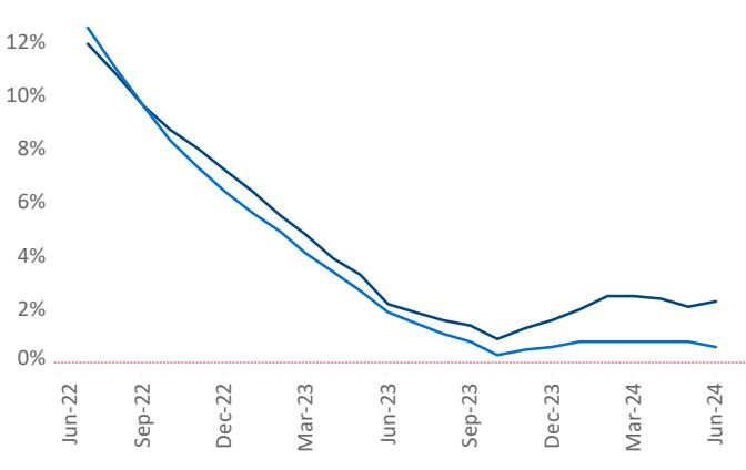
Absorbed Completions T12