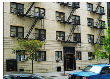
222 E. 56th St.

City: New York Buyer: Lalezarian Developers Purchase Price: $25 MM Price per Unit: $416,666