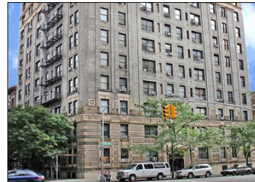
838 West End Ave.

City: New York Buyer: Akelius RE Management Purchase Price: $72 MM Price per Unit: $1,043,478