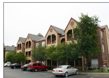
Preserve Wells Branch

City: Austin, Texas Buyer: Housing Authority of Austin Purchase Price: $32 MM Price per Unit: $102,727