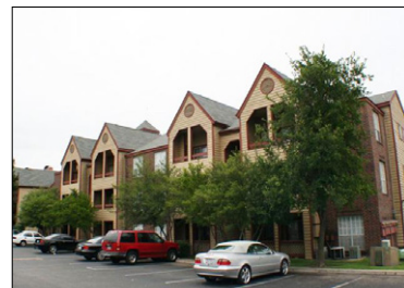
Preserve Wells Branch

City: Austin, Texas Buyer: Housing Authority of Austin Purchase Price: $32 MM Price per Unit: $102,727