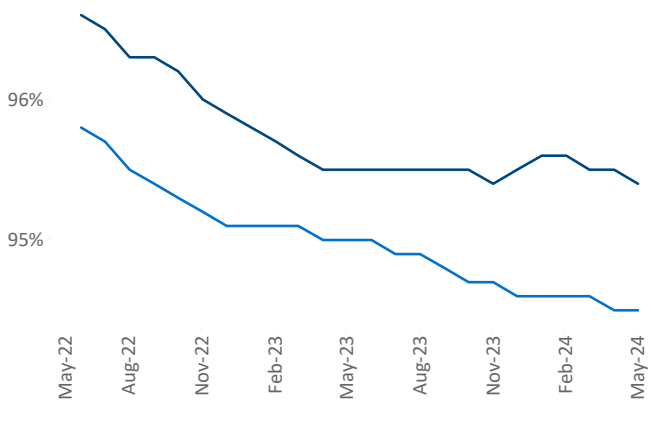
Units Under Construction as % of Stock