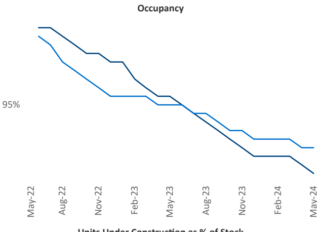
Units Under Construction as % of Stock