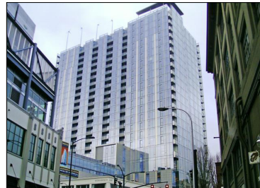
Indigo at Twelve West

City: Portland, Ore. Buyer: Greystar Purchase Price: $206 MM Price per Unit: $754,579