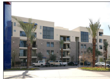
Ten01 on the Lake

City: Tempe, Ariz. Buyer: PGIM Real Estate Purchase Price: $115 MM Price per Unit: $219,885