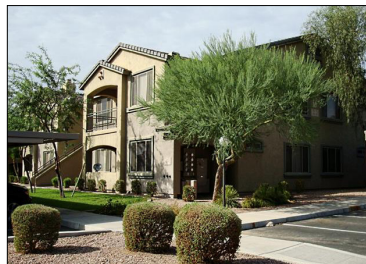
Kota North Scottsdale

City: Scottsdale, Ariz. Buyer: CBRE Global Investors Purchase Price: $160 MM Price per Unit: $217,527