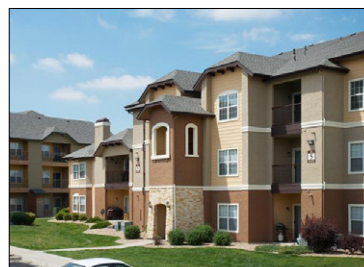
Haven 124 at Eastlake Station

City: Northglenn, Colo. Buyer: Magnolia Capital Purchase Price: $124 MM Price per Unit: $220,641