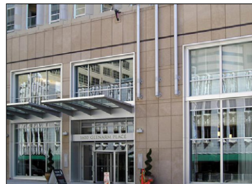
1600 Glenarm Place

City: Denver Buyer: Northland Investment Corp. Purchase Price: $131 MM Price per Unit: $393,393