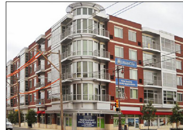
777 South Broad

City: Philadelphia Buyer: AIMCO Purchase Price: $63 MM Price per Unit: $428,749