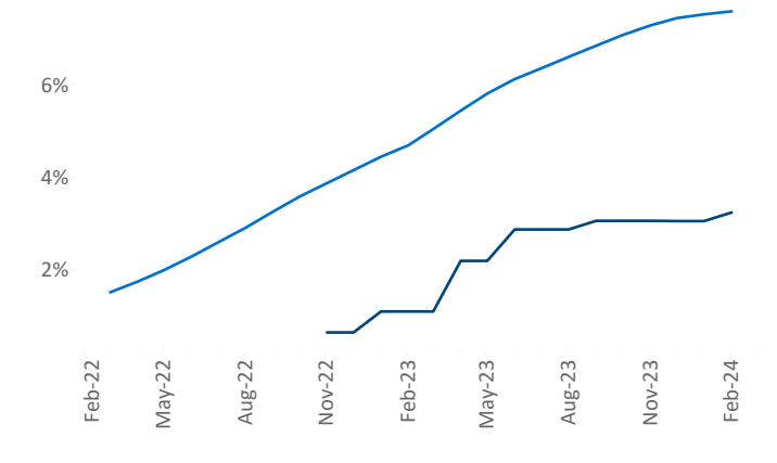
Rent Growth YoY 16% 14% 12% 10% 8% 6% 4% 2% Aug-22 Aug-23 Feb-24 Feb-22 May-22 Feb-23 Absorbed Completions T12