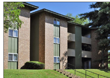
City Side Flats

City: Nashville, Tenn. Buyer: Emma Capital Purchase Price: $25 MM Price per Unit: $122,139