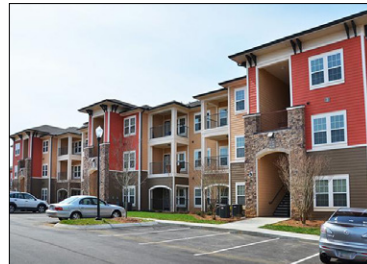
Panther Creek Parc

City: Murfreesboro, Tenn. Buyer: Michelson Organization Purchase Price: $58 MM Price per Unit: $166,236