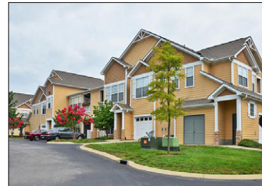
The Hamptons at Woodland Pointe

City: Nashville, Tenn. Buyer: Security Properties Purchase Price: $45 MM Price per Unit: $188,646