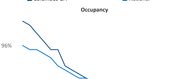
Feb-22 Aug-22 Nov-22 May-23 Aug-23 Nov-23