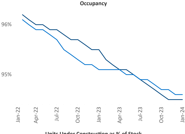
Units Under Construction as % of Stock