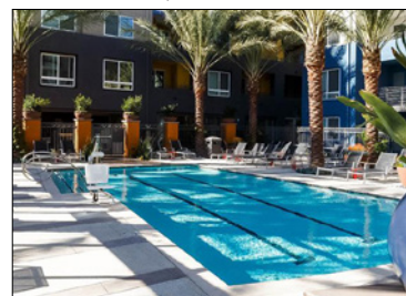
Bell South Bay

City: Inglewood, Calif. Buyer: Bell Partners Purchase Price: $123 MM Price per Unit: $465,909