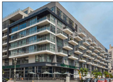
Eighth & Grand

City: Los Angeles Buyer: Brookfield Properties Purchase Price: $393 MM Price per Unit: $561,714