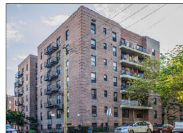
22-11 New Haven Avenue