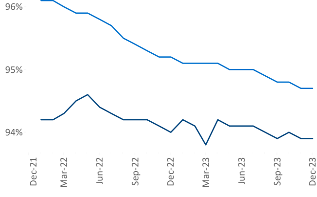
Units Under Construction as % of Stock