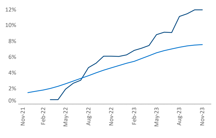
Rent Growth YoY 18% 16% 14% 12% 10% 8% 6% 4% 2% 0% Feb-22 Aug-23 Nov-23 Nov-21 Nov-22 Feb-23 Absorbed Completions T12