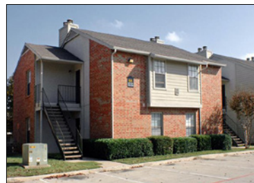
Landmark at Sutherland Park

City: Plano, Texas Buyer: Conti Org. Purchase Price: $63 MM Price per Unit: $131,994