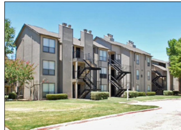
Lake Village North

City: Garland, Texas Buyer: Madera Cos. Purchase Price: $82 MM Price per Unit: $97,213