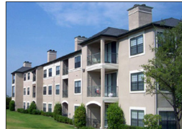
7421 on Frankford

City: Dallas Buyer: Knightvest Capital Purchase Price: $82 MM Price per Unit: $140,722