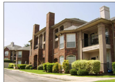
Whispering Creek Villas

City: San Antonio Buyer: Hilltop Residential Purchase Price: $32 MM Price per Unit: $123,411