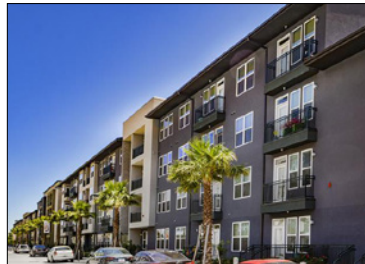
The Flats at Big Tex

City: San Antonio Buyer: The Accend Cos. Purchase Price: $69 MM Price per Unit: $205,667