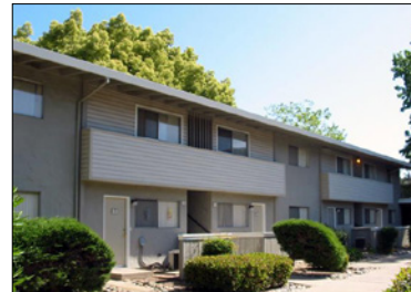
The Eleven Hundred

City: Sacramento, Calif. Buyer: OpenPath Investments Purchase Price: $69 MM Price per Unit: $122,123