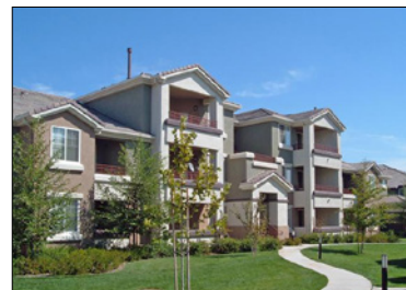
The Artisan Apartment Homes

City: Sacramento, Calif. Buyer: Sequoia Equities Purchase Price: $53 MM Price per Unit: $201,808