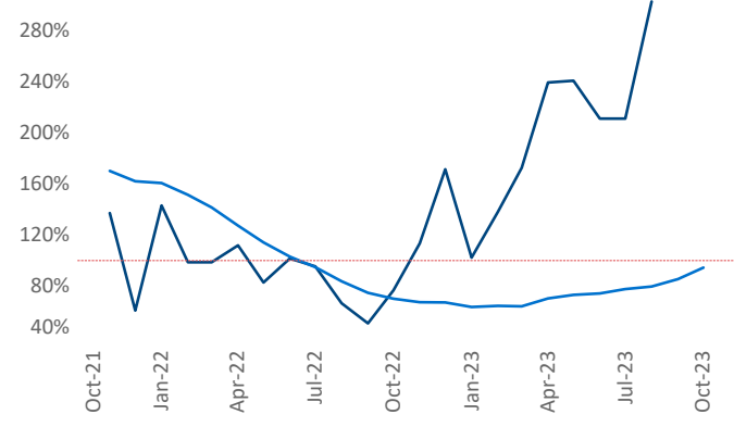
Absorbed Completions T12