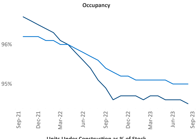
Units Under Construction as % of Stock