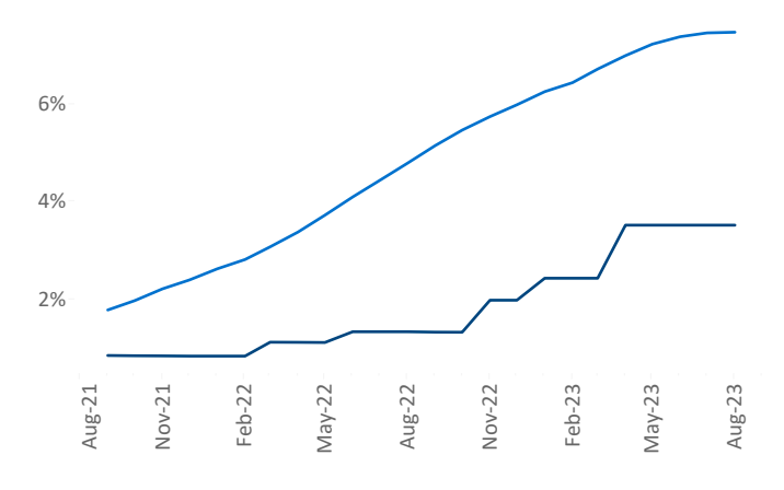
14% 12% 10% 8% 6% 4% 2% 0% -2% Feb-22 Aug-22 Nov-21 Nov-22 Feb-23 May-23