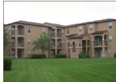
The Arbors at Maitland Summit

City: Orlando Buyer: Redwood Capital Group Purchase Price: $102 MM Price per Unit: $153,846