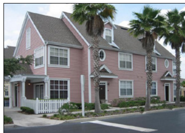
ARIUM Hunters Creek

City: Orlando Buyer: Bluerock Real Estate Purchase Price: $98 MM Price per Unit: $183,271