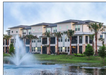
Lindon Audubon Park

City: Orlando Buyer: Harbor Group International Purchase Price: $97 MM Price per Unit: $216,036