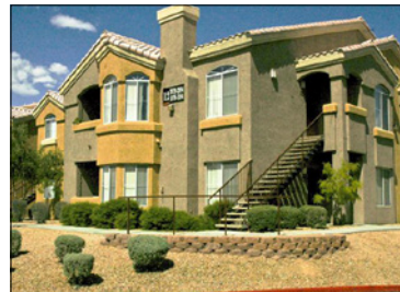
Broadstone Flamingo West

City: Las Vegas Buyer: LivCor Purchase Price: $52 MM Price per Unit: $161,265