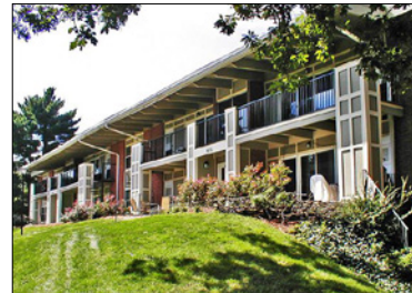
The Commons at Windsor Gardens

City: Norwood, Mass. Buyer: AllianceBernstein Purchase Price: $199 MM Price per Unit: $217,724