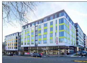
Venn at Main

City: Bellevue, Wash. Buyer: Equity Residential Purchase Price: $177 MM Price per Unit: $504,286