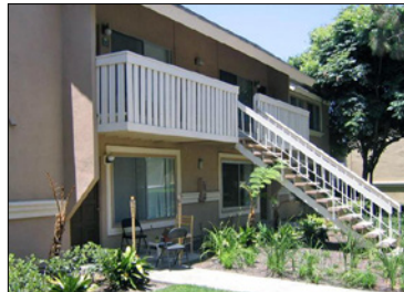
Surf at 39

City: Huntington Beach, Calif. Buyer: Interstate Equities Corp. Purchase Price: $134 MM Price per Unit: $335,000