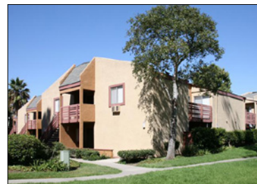
The Villas at Tustin

City: Santa Ana, Calif. Buyer: Bascom Group Purchase Price: $94 MM Price per Unit: $231,527