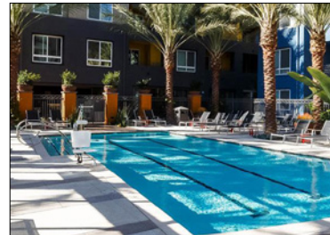
Bell South Bay

City: Inglewood, Calif. Buyer: Bell Partners Purchase Price: $123 MM Price per Unit: $465,909