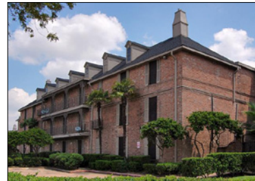
The Vista on Genner

City: Houston Buyer: Dalcor Purchase Price: $70 MM Price per Unit: $86,420