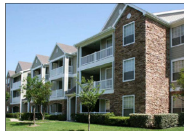
Knox at Westchase

City: Houston Buyer: Knightwest Capital Purchase Price: $55 MM Price per Unit: $105,818