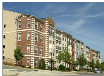
Lakeside at Milton Park

City: Alpharetta, Ga. Buyer: Olen Properties Purchase Price: $98 MM Price per Unit: $213,124