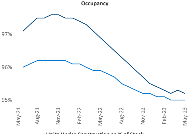
Units Under Construction as % of Stock