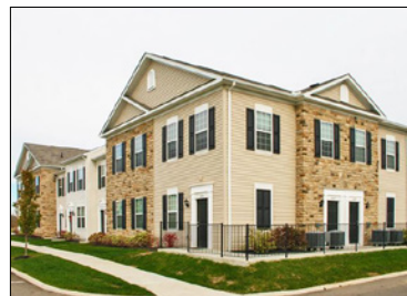
The LC Greene

City: Canal Winchester, Ohio Buyer: Dietz Property Group Purchase Price: $46 MM Price per Unit: $107,944