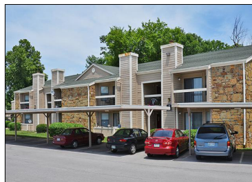
Brandywine I & II

City: Nashville Buyer: Starwood Capital Group Purchase Price: $76 MM Price per Unit: $120,000