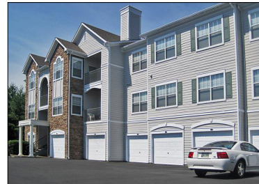
IMT Cool Springs–101 Gillespie Drive

City: Franklin, Tenn. Buyer: IMT Capital Purchase Price: $85 MM Price per Unit: $221,114