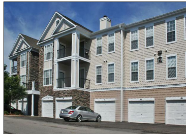
IMT Cool Springs–201 Gillespie Drive

City: Franklin, Tenn. Buyer: IMT Capital Purchase Price: $98 MM Price per Unit: $205,696