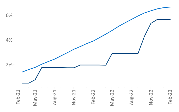
Units Under Construction as % of Stock