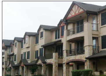
The Landing at Round Rock

City: Round Rock, Texas Buyer: Starlight Investments Purchase Price: $93 MM Price per Unit: $159,634