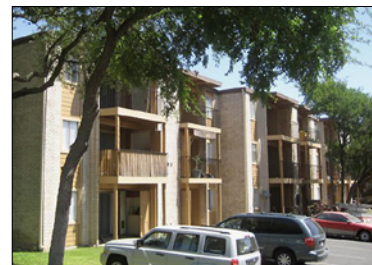
The Ridge at Barton Creek

City: Austin, Texas Buyer: Arel Capital Purchase Price: $48 MM Price per Unit: $117,121