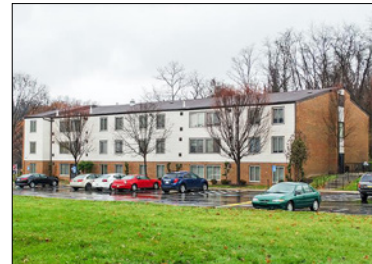
Mifflin Estates/Camden Hills

City: West Mifflin, Pa. Buyer: BLVD Capital Purchase Price: $11 MM Price per Unit: $55,224